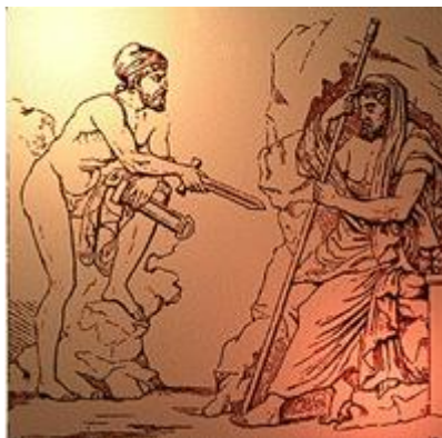
Oedipus menacing Tiresias, who clearly sulks. The drawing is very similar, even identical to some said to be describing Ulysses menacing Tiresias during his descent into the Underworld.

Tiresias is best known for the revelations he made to Oedipus who wanted nothing to do with him nor with consulting diviners: his was panic under the guise of rationality,