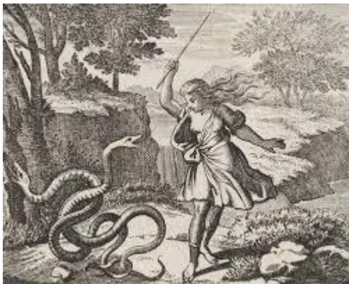
Tiresias, here a woman, with a stick facing a couple of snakes copulating. Snakes and rods form possibly the most important emblems of magic.

For the record: Hecuba was the queen of Troy. After the end of the war and the defeat of the Trojans, she saw her family decimated and her daughters become slaves of the victorious Achaeans. Versions vary about her own fortune, but it seems that she became the concubine slave of Ulysses / Odysseus – this calls for several exclamation marks!!!! On one of her first journeys with Ulysses, she learned that King Polymestor, to whom she had entrusted her son Polydore, had killed the child to take possession of the inheritance. She tears out his eyes (once again!) and massacres his two children. And metamorphoses into a rabid bitch. Ulysses tried to restrain her. Question: did he plan to adopt the child on this first trip? Did he do so afterwards? Another question: Hecuba did not commit suicide at the end of the war, as her rank and honor could have predicted. Why not? And the most human and difficult question to ask: « Madame, did you share his bed? »