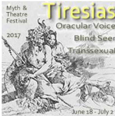
From an engraving by Giambattista Tiepolo from Scherzi di Fantasia , circa 1745.

Tiresias is a disquieting character, perhaps the greatest diviner in Antiquity, feared for his prophecies of doom and ill omen, and so, considered a jinxed harbinger of bad luck, a killjoy. But the fact is he is a figure of truth: resistances to his voice are rooted in a panic fear of his clairvoyance 1 . Moreover, in the depths of our intuitive memories, we know his insights are somehow related to his shamanic metamorphoses 2 – to transsexuality.